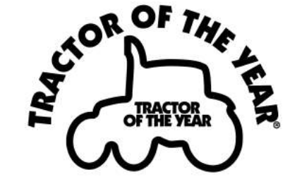
Category, dedicate to open field tractors, with no limits