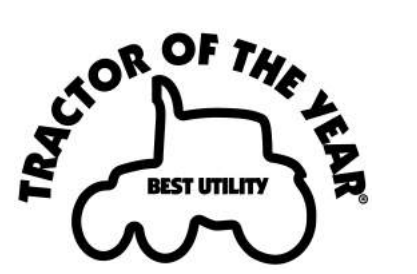
Category for multi purpose and utility tractors with more then 70 Hp Maximum 4 cylinders engine Maximum operating weight 8.900 Kg