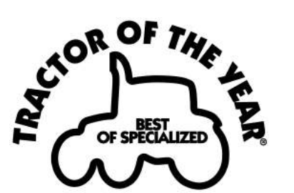
Category for Orchard; vineyard, hill and mountain tractors